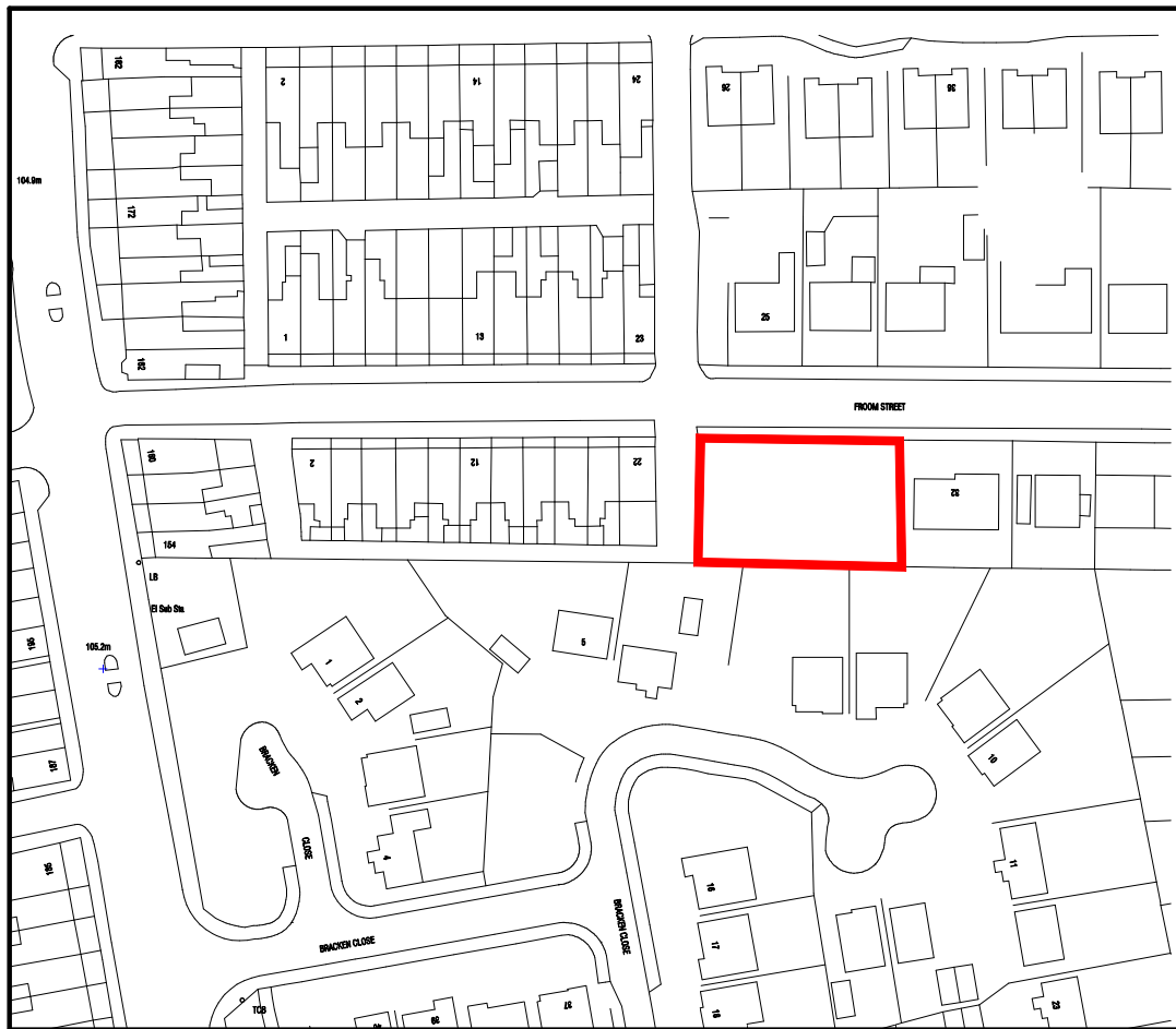
Location Plan (Scale 1:1250 @ A4)